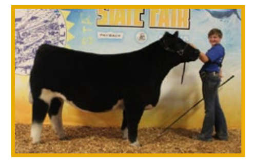
Champion Market Heifer Payton Beare