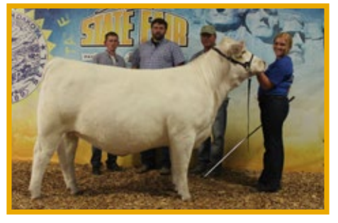
Champion Exotic Breeding Heifer Cagney Effling