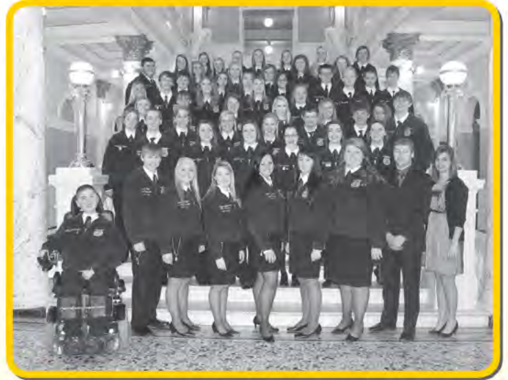
SD District Officers, State Officers and Ambassadors pose on the Capitol steps before their tour.

Association, and our SD FFA Star Partners: Northland Ford, Monsanto, North Central Farmers Elevator, ADM Benson Quinn, CHS Foundation, South Dakota Wheat Growers, South Dakota Soybean Research and Promotion Council, Aurora Cooperative, Butler Machinery Company, C & B Operations, DuPont Pioneer, East River Electric Power Cooperative, Farm Credit Services of America, Hanson & Associates, LLC, RDO Equipment, and Wilbur-Ellis.